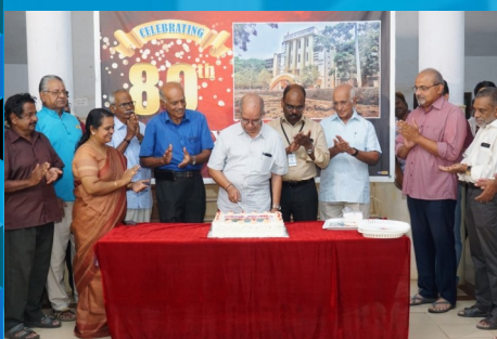
CET's 80th birthday was celebrated on 3/7/2019 (Wednesday). To earmark the beginning of 80th anniversary celebrations, a cake cutting ceremony was arranged at the lobby of the main building.

On this occasion of being 80 years young, we should look at this as an opportunity to unlearn, pivot and adopt new forms of learning to stay ahead of the curve as the concept of jobs itself is dramatically changing. Effective teaching focuses on why and how , not what. The goal should be to spark each student's imagination, to find a hook in their heart and mind so that they feel a need to learn the material. The rest is easy, because the student then drives his or her learning. Our role should be to ask provocative questions, and to help the students make a path toward the answers. If they are motivated to find the path, they will carve it themselves.